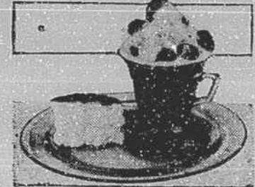
Newlyweds Favor Honeymoon Cake and Paradise Pudding.

"You must come to dinner," she says, and come they must, these critical in-laws who dread this demonstration of amateur cuisine. The bride is calm at her debut. She's proud of her vegetable soup, and the cheese sticks she serves with it. Roasts are simpler and surer than any other meats and