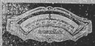
Come in and try this New Quick-Vision Dial. It's an exclusive Atwater Kent feature.

MODEL 70 LOWBOY $119. less tubes. Other models priced to $195, less tubes.