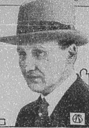
Every time we strike a match, Ivar Kreuger, Swedish match magnate, adds to his already bloated fortune.

passed through the hazy tobacco country, the tobacco fields plowed and harrowed and almost ready for transplanting the plants from the canvas-covered seed-beds. Cigarette manufacturers are responsible for the increased prosperity of the burley tobacco growers. Up to a few years ago only the Virginia-leaf tobacco was used in cigarettes. Then the American Tobacco Company developed and promoted a cigarette made of the burley leaf. And now many of the popular brands are made of this Kentucky-grown tobacco.