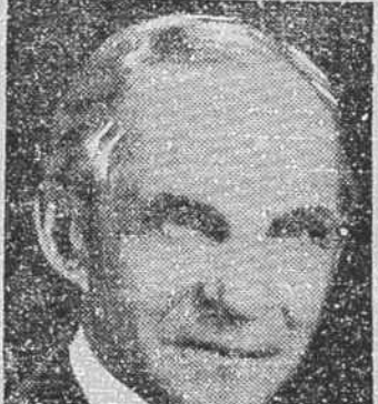
DETROIT . . . A new portrait study of Henry Ford made at his home which shows the automobile magnate as he appears today. His faith in the future is best shown in his program of spending millions enlarging his great plant to make 1935 his greatest production year.