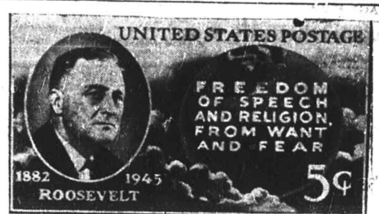
ROOSEVELT BIRTHDAY STAMP . . . A new five-cent stamp in the Roosevelt memorial series, with an issue date of January 30, the 64th anniversary of the birth of the late Pres. Franklin D. Roosevelt, has been released by the post office. The stamp is of special delivery size and printed in blue.

Winter is the time to prune, spray boys have a record of 100 percent and thin orchards, according to participation. Other groups are of horticulturists of the agricultural extension service.