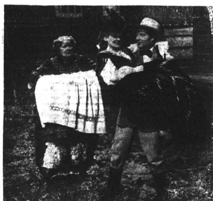
Constance Moore seems not the least disturbed as William Elliott carries her across the muddy street. Ruth Donnelly seems to be the only one in distress. This exciting scene is from Republic's magnificent adventure romance, "In Old Sacramento," playing at the Appalachian Theatre July 4th.