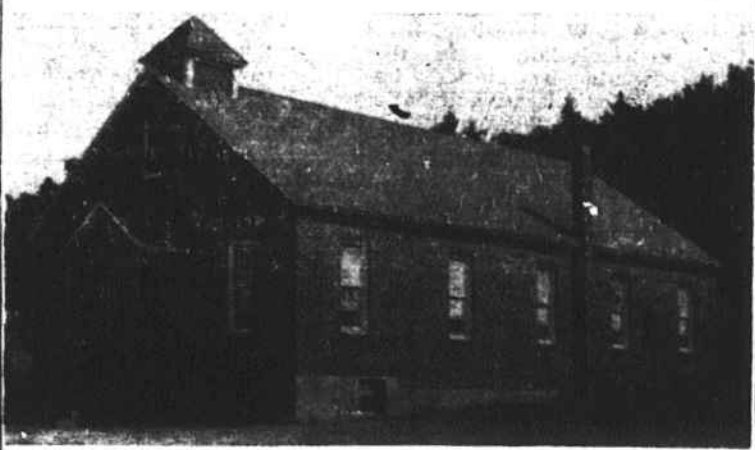
Laurel Springs Baptist Church at Laxon, N. C., where the 108th session of the Three Forks Baptist Association will be held on August 24 and 25th.