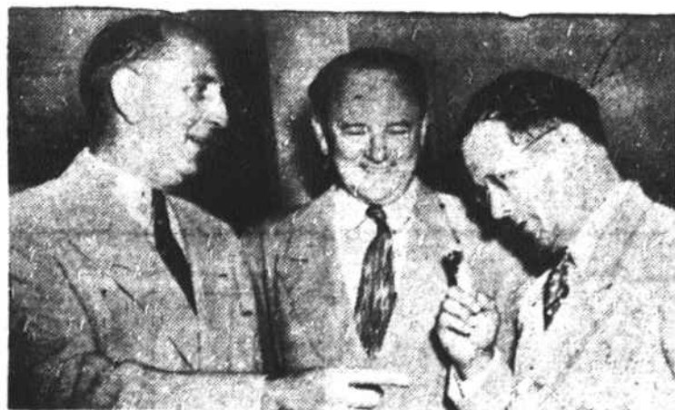
Dixie Democratic senators get together to plan a last ditch action against President Truman's civil rights program. Shown, left to right, are: Sen. Richard B. Russell, Senator Harry F. Byrd of Virginia, and Sen. Allen J. Ellender of Louisiana. Russell, who hails from Georgia and leader of the group, later told reporters that the group discussed "specific strategy for meeting any emergency."