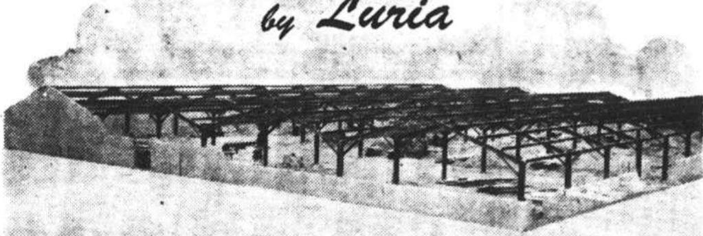
Framework of Luria Building showing masonry side walls.