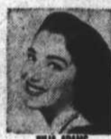
Also: Magic in the Sun.