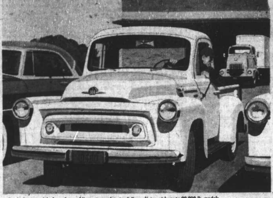
Trucks for every job, from the world's most complete truck line—1/2-ton pickups to 90,000 lb. models.

There's only one way to find out if an INTERNATIONAL handles the way you want a truck to handle—and that's to drive one yourself. That's why we extend this invitation to you: Take an INTERNATIONAL out on the road. See how it handles. Try it on rough stretches. Back it, maneuver it, jockey it into tight spots. Compare it point for point with your present truck. We are confident you will find INTERNATIONAL the sweetest-handling truck you've ever driven (even sweeter with optional Power Steering!) Make us prove that we're right! Come in and take our IH "handling ease test." It's a real convincer!