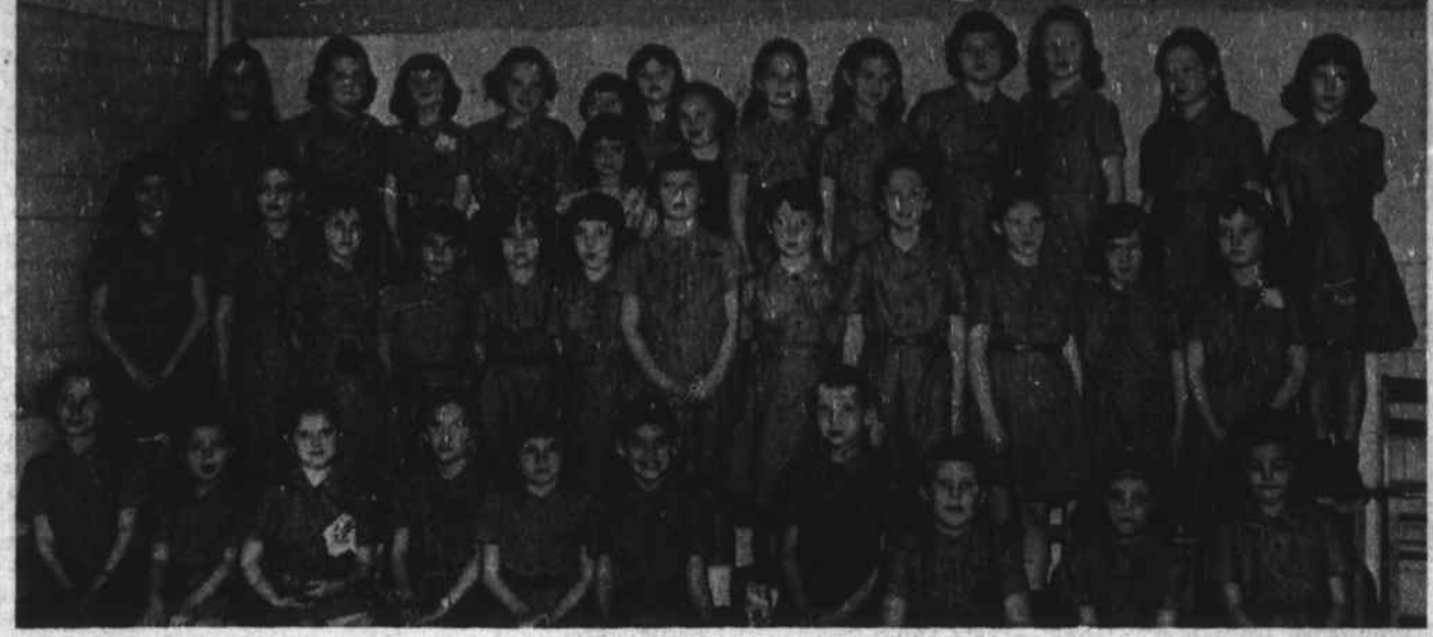
BROWNIE SCOUTUS ASSEMBLE AT ELEMENTARY SCHOOL FRIDAY