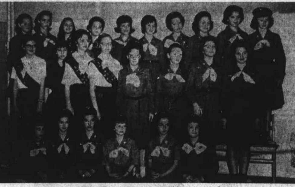
TWO TROOPS OF GIRL SCOUTS IN BOONE