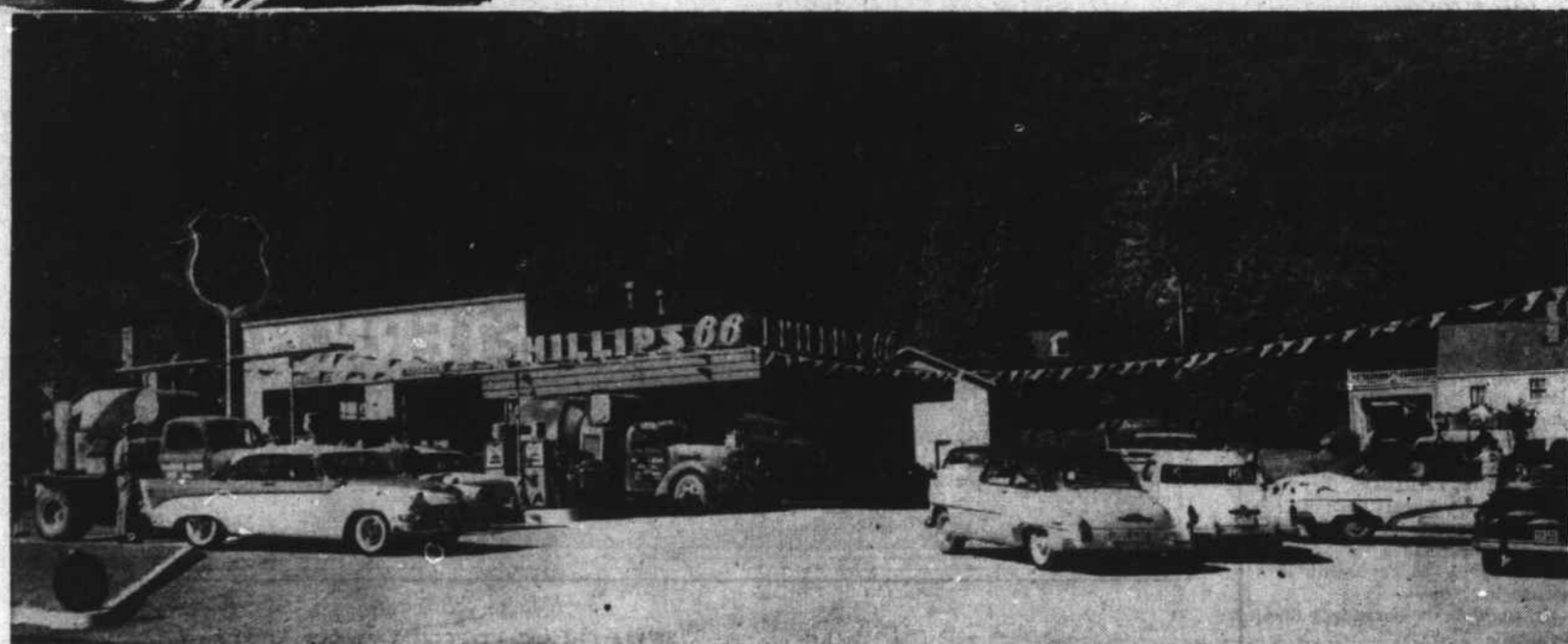
Come see us. Make it a point to drive in and look over our Fox Phillips 66 Station. You'll find it set up with one idea in mind—to give you top notch service. We are equipped to give you complete car care ... from a simple tire check to dependable lubrication. So come in, and you'll drive away happy