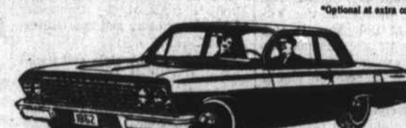
New Bel Air 2-Door Sedan

See the '62 Chevrolet, the new Chevy II and '62 Corvair at your local authorized Chevrolet dealer's