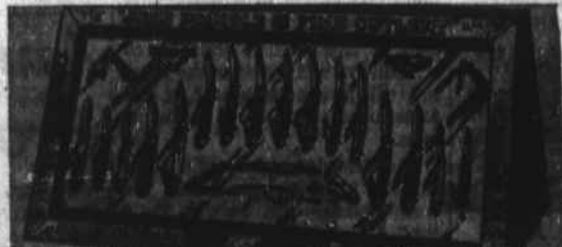
This Case of Kabar Knives