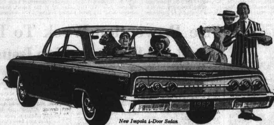
New Impala 4-Door Sedan