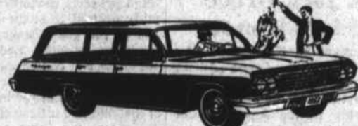
New Biscayne 4-Door 6-Passenger Station Wagon

There are longer lived mufflers for all engines. A Grand Canyon of a trunk. Magic-Mirror finish. And, well, we could write a book about it all. Matter of fact, your Chevrolet dealer's got it all down on paper. Get a fill-in from him now.