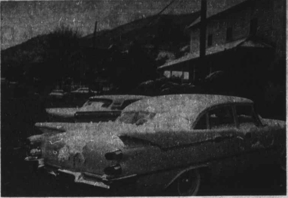
SNEAK SNOW—Nobody expected this kind of weather last week. These cars bear evidence of the snow which fell on Boone Thursday night. Although it did not stick on the streets visitors to the area Sunday could see spots of snow on the hillsides as they enjoyed the fall color of the trees. Precipitation for Thursday and Thursday night was reported to be 1.19 inch. The snow was preceded by sleet, hail, and rain, and snow flurries continued through most of Friday despite some sunshine.

President Kennedy has announced that he plans to keep out of any contest over the choice of a Speaker of the House if Representative Sam Rayburn is unable to resume his position. The President said that the House had a Speaker and the House will elect its next Speaker and it would be unwise for anyone to indicate a preference.