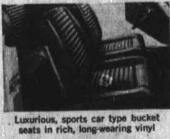
Luxurious, sports car type bucket seats in rich, long-wearing vinyl

It's the new Signet 200 model! It looks expensive... sporty, sleek hardtop styling... sports car type interior... all-vinyl bucket seats... peppy 101-horsepower engine. It's the kind of ego-boosting car you've always wanted to own but thought you couldn't afford. But now it's easily within your grasp. For the Signet 200 Valiant is the lowest-priced hardtop with bucket seats in America! Let us show you a won-