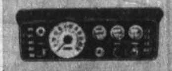
Brand-new instrument panel on the '62 Valiant is smart and easy to read

derful deal. Come in right now and let's talk it over.