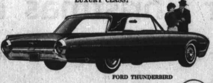
LUXURY CLASS: FORD THUNDERBIRD The top class—cars for people who want the very finest. First of the trim-size luxury cars, the 4-passenger Thunderbird is the most distinctive car in this class. Its styling set the trend for an entire generation of cars and now finds a new elegance in the London. And Thunderbird's performance is just this side of flight.

WHATEVER YOU'RE LOOKING FOR IN A CAR . . . LOOK TO THE LONG FORD LINE AT YOUR FORD DEALER'S WINKLER MOTOR COMPANY, INC. DEPOT & HOWARD STS. Dealer Lic. No. 1170 BOONE, N. C.