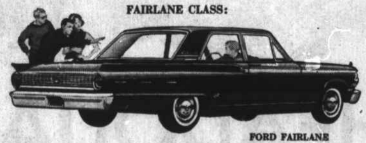
FAIRLANE CLASS: FORD FAIRLANE The Ford Fairlane is the first member of a new class which combines the advantages of both compacts and big cars . . . you get big car room, ride and performance . . . compact savings and maneuverability. Priced below many compacts, Fairlane even rivals some in gas economy. Has twice-a-year maintenance introduced by the Galaxies.