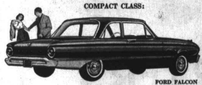
COMPACT CLASS: FORD FALCON This class includes cars with 106- to 114-inch wheelbase. Most popular by far (a million happy owners!) is the Ford Falcon. Falcon is America's lowest-priced* 6-passenger car, set a 25-year record for Sixes or Eights in last spring's Mobilgas Economy Run, gives you a choice of 13 models, including the Futura and new Falcon Squire wagon.