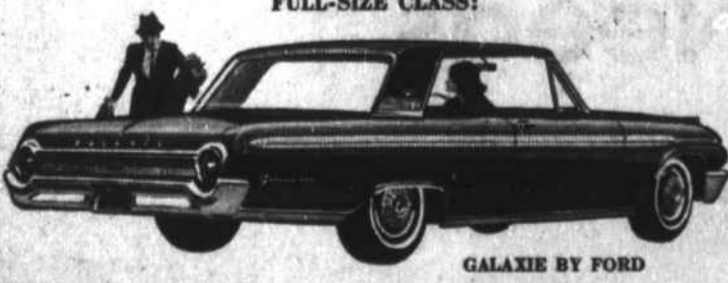
FULL-SIZE CLASS: GALAXIE BY FORD The class for families who want big car comfort, performance and prestige. Value leader is the Ford Galaxie—which has every essential feature of far costlier fine cars. With the optional Thunderbird 390 V-8 engine, a Galaxie will outperform America's most expensive luxury cars. Requires servicing only twice a year, or every 6,000 miles.