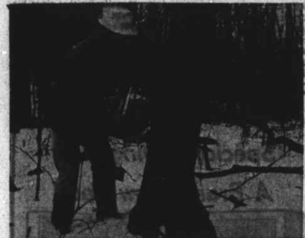
CUTTING TIMBER ALONG ONE OF THE SKI SLOPES

GREENE FURNITURE CO. Edmisten Building Boone, North Carolina