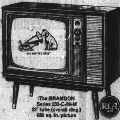
The BRANDON Series 233-C-89-M 23" tube (overall diag.) 282 sq. in. picture

RCA VICTOR New Vista TV Priced from $279.95