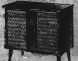
The BARCAROLLE 3V200 Series

RCA VICTOR TOTAL SOUND STEREO from $189.95