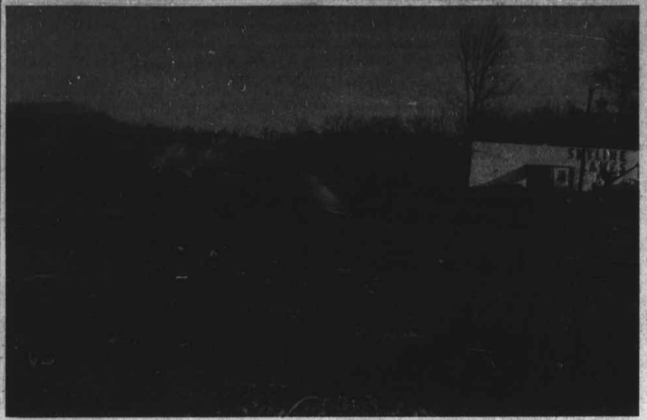
FUTURE FACTORY SITE?—Workers began clearing a section of land adjacent to the Skyline (bowling) Lanes south of Boone last week at a site which was speculated by some to be the grounds on which a new factory or business concern

You can't reform the world alone in a few years nor in a hundred. Why get hot and bothered?