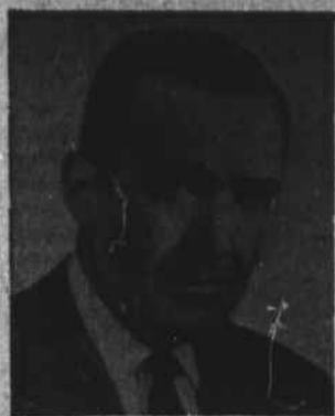
Edward R. Murrow

Fontana Village, Dare County and the Carolinian Hotel at the Ohio Valley Show.