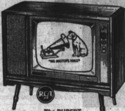
The RUPERT Series 233-C-80-M 23" tube (overall diag.) 282 sq. in. picture RCA VICTOR New Vista TV