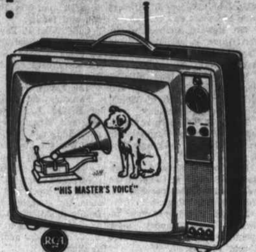
The MODERNETTE SPORTABOUT RCA VICTOR New Vista TV

New Vista Means Dependable Performance and Pleasure