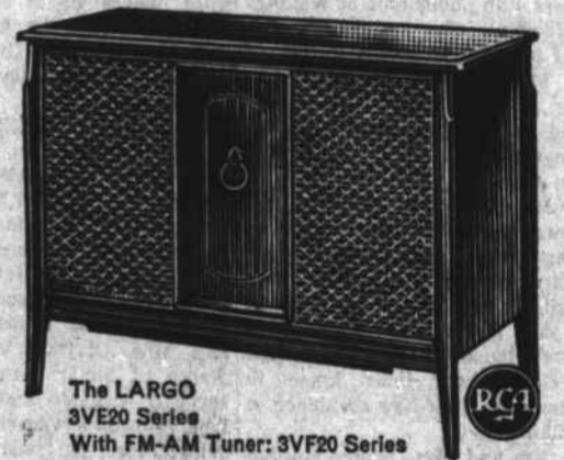
The LARGO 3VE20 Series With FM-AM Tuner: 3VF20 Series