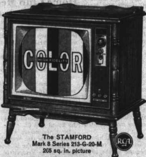
The STAMFORD Mark 8 Series 213-G-20-M 26 1/2 sq. in. picture