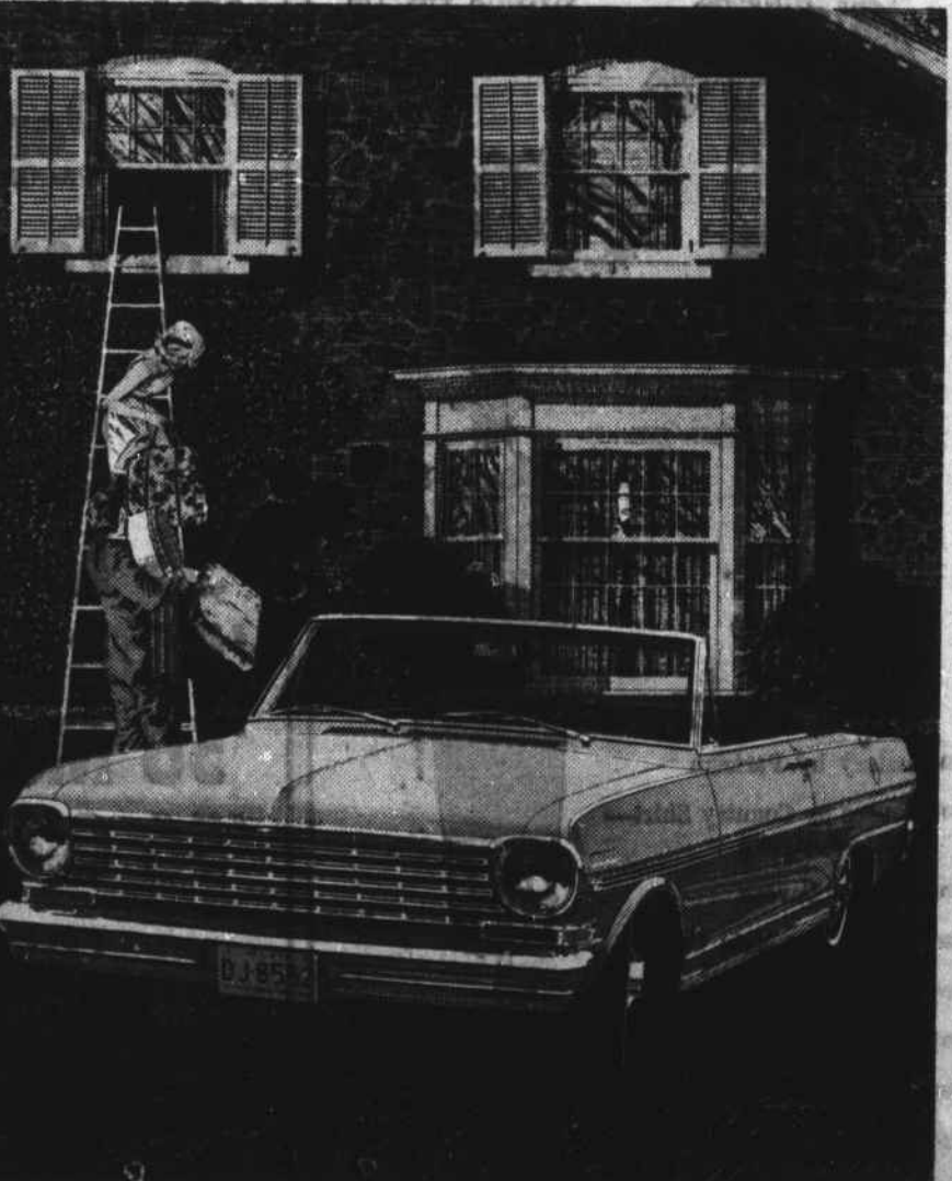
Chevy II Nova 100 SS Convertible shown. Also available as SS Coupe. Super Sport equipment optional at extra cost. Also a choice of 10 regular Chevy II models.

If you'd like to escape everything but pure enchantment, try this Chevy II Nova SS with full Super Sport equipment. Special instrument cluster. Front bucket seats. All-vinyl interior. Distinctive SS identification. Full wheel disks. Choice of three-speed shift or floor-mounted Powerglide automatic* with sporty range selector console. All this plus Chevy II standard features: flush-and-dry ventilating system that helps remove rust-causing elements from rocker panels; battery-easing Delco-tron generator; convenient self-adjusting brakes; longer lasting exhaust system; styling fresh as morning coffee, poured into a rugged Body by Fisher—and more. You'll find two can live as cheaply as one—when they're living it up in a new Chevy II. *Optional at extra cost.