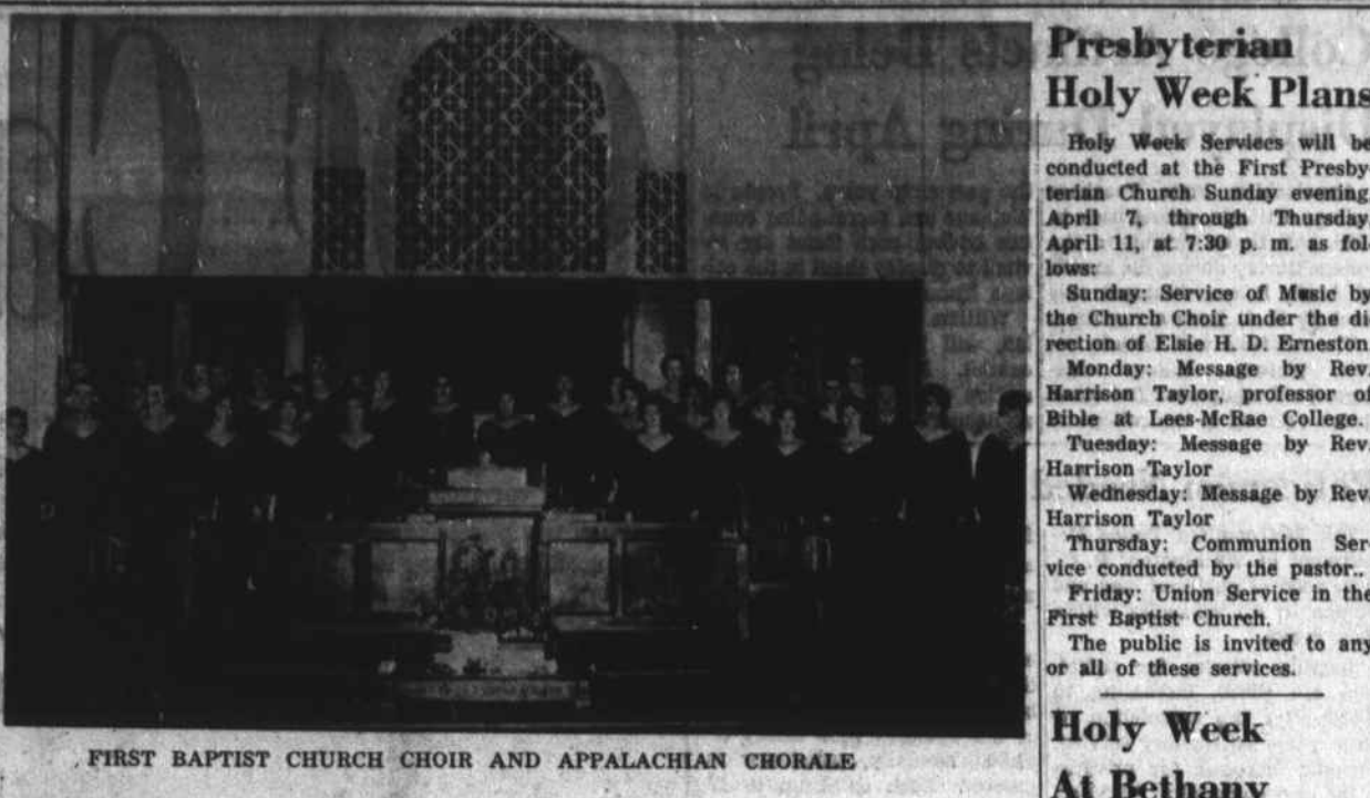
FIRST BAPTIST CHURCH CHOIR AND APPALACHIAN CHORALE