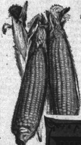
Wood's & Funk's

Seed Corn Grass Seed Onion Sets—Seed Oats Certified Seed Potatoes Bulk Garden Seeds