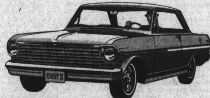
NOVA SUPER SPORT COUPE