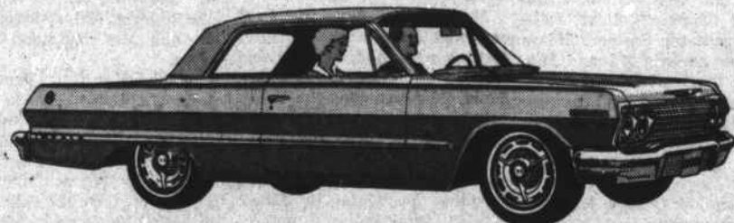
IMPALA SUPER SPORT COUPE