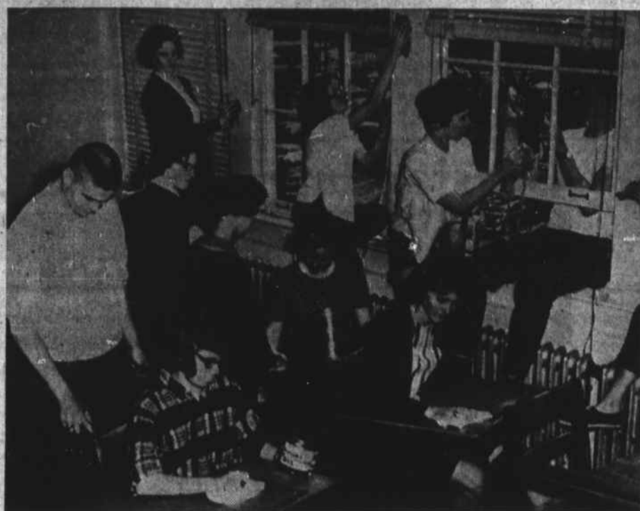
CLEAN-UP. —The annual spring clean-up day was held at Appalachian High School Thursday. Students dressed informally and worked enthusiastically to clean the building. They washed windows, woodwork, desks, and every-