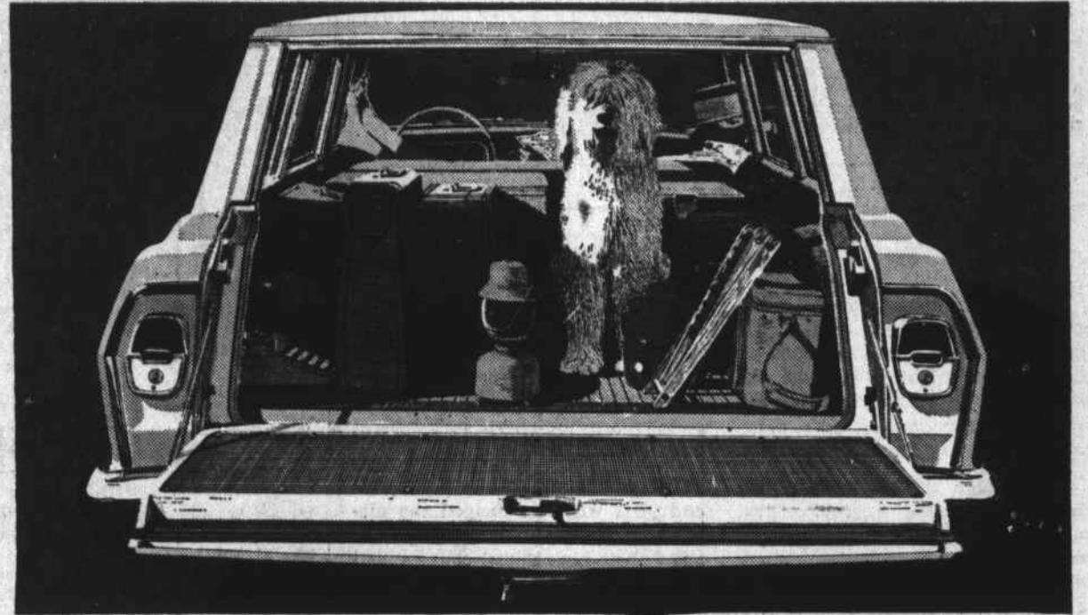
Chevy II Nova 400 6-Passenger Station Wagon

A Chevy II wagon looks this big when you load it up