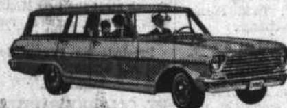
CHEVY II Nova 400 4-Door

And See The 12th Opening Night Of HORN IN THE WEST