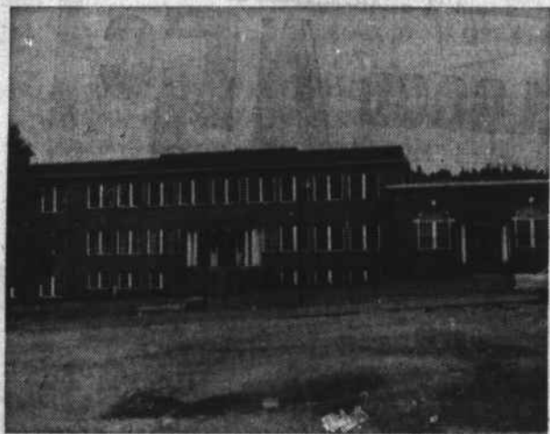
Blowing Rock High School