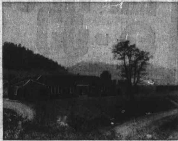
Bethel High School