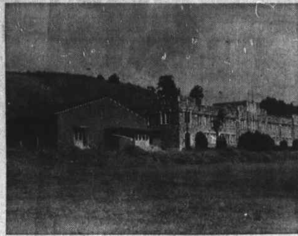
Cove Creek High School