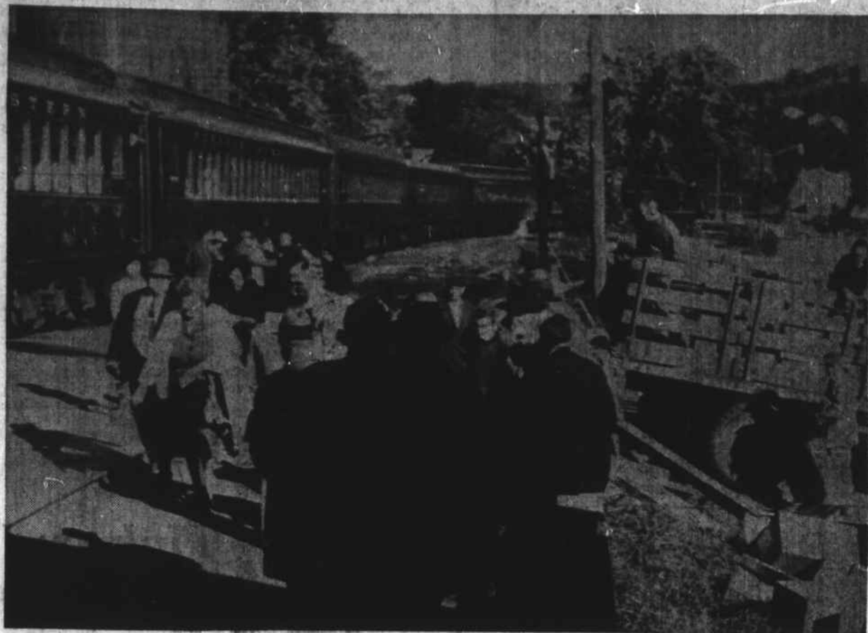
CROWDS WAIT FOR "VIRGINIA CREEPER" TO LEAVE