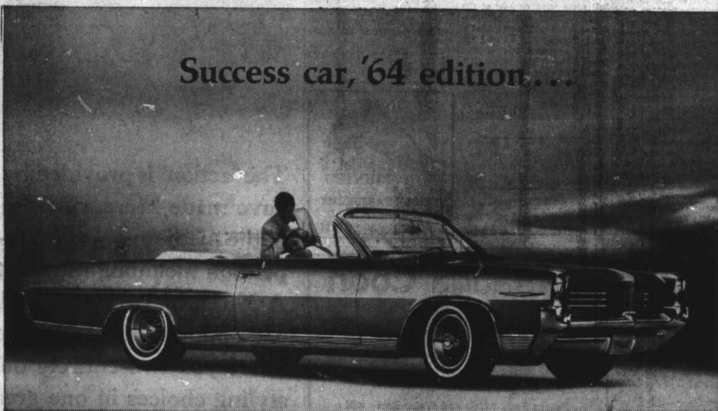
Success car, '64 edition...