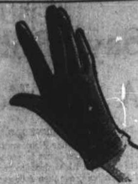
OUR OWN HEIRESS ONE-SIZE STRETCH-FIT KNIT GLOVES