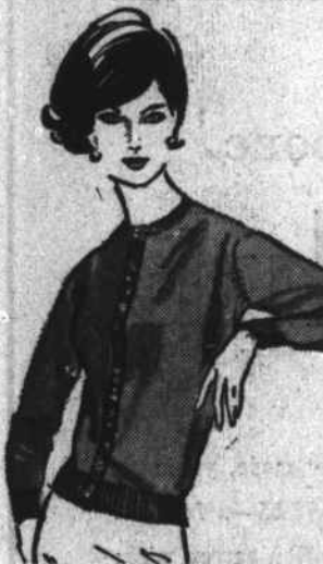
OUR OWN "B CASUAL" RIBBON-FRONT CARDIGAN

White or gay colored embroidery on quality cotton. Florals, His and Hers, Mr. and Mrs.