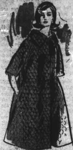
THE QUILTED DUSTER GLORIFIED IN VELVET

Arnel® triacetate and nylon fleece, rayon satin piping. Pink, white with blue, white with pink. S-M-L.