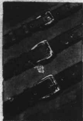
OUR OWN ARCHDALE MEN'S GENUINE LEATHER BELTS

Life-size! True-life colors! Graceful decoration for mantle, window. Give in pairs!