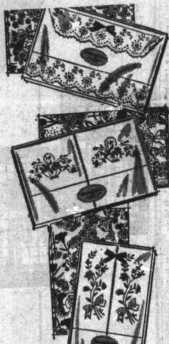
OUR OWN "STATE PRIDE" BOXED PILLOWCASE PAIRS

Lace edged, appliqued, fluted or strictly tailored! White, some in black, red, pastels. Two styles in nylon satin tricot. All in sizes 4 to 8, two in 4 to 10.