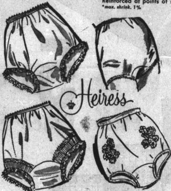
NYLON TRICOT GIFT BRIEFS, TAILORED OR LACE TRIMMED

Narrow, wide, wider! Excessive look buckles; smooth and textured leathers. 28-42".