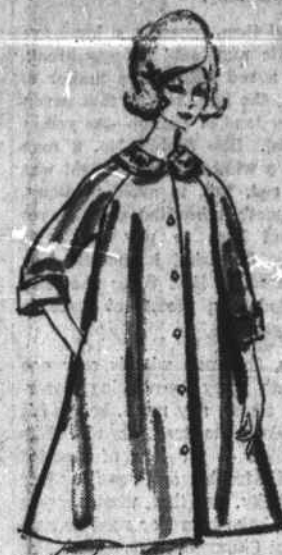
matches embroidered nylon tricot sleepwear WARM, FLUFFY FLEECE WITH FINE BEAUVAIS EMBROIDERY

Is a One Stop for Every Member of the Family