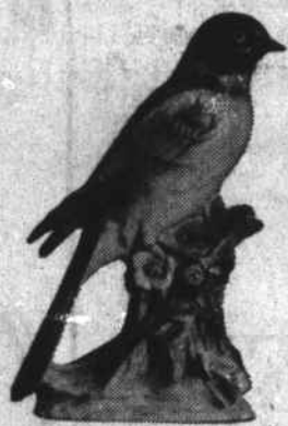
HANDPAINTED CHINA BIRDS IN TRUE-LIFE COLORS

There's high fashion in the A-line silhouette, the puritan collar! Deep-piled rayon velvet in rich red, blue, green, royal or black. Sizes 8 to 18.