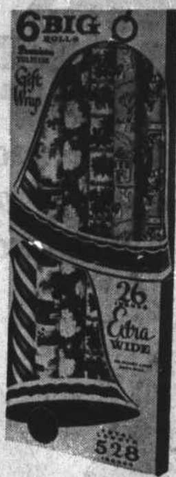
GIANT 6-ROLL SUPPLY GAY CHRISTMAS WRAPPING

Welcome gifts for any homemaker! Choose the half-apron with its convenient, button-on fingertip towel; the pretty "cobblerette" or the reversible print-and-solid color. All in cheery, colorful cottons.