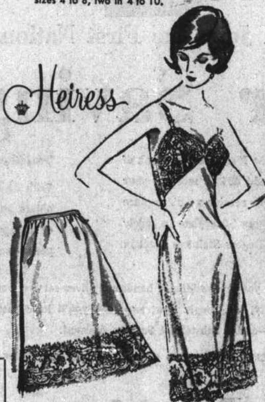
GIFT IDEA! SLIP AND HALF SLIP OF NEW ANTRON® NYLON TRICO®

Our Children's Dept. Will Thrill the Wee Small Boy And Girl as Well as the 7 to 14 and Subteen Crowd