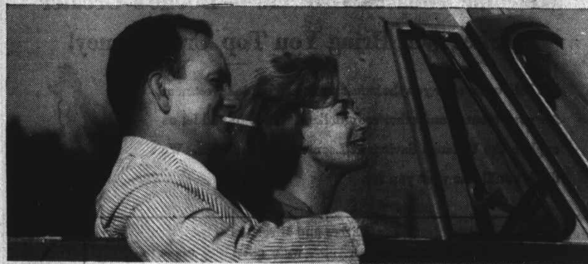
but not from the girls.