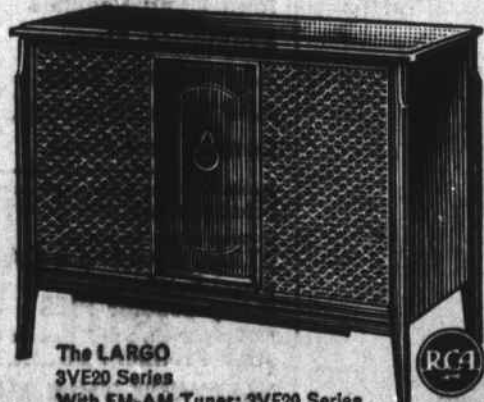
The LARGO 3VE20 Series With FM-AM Tuner: 3VF20 Series