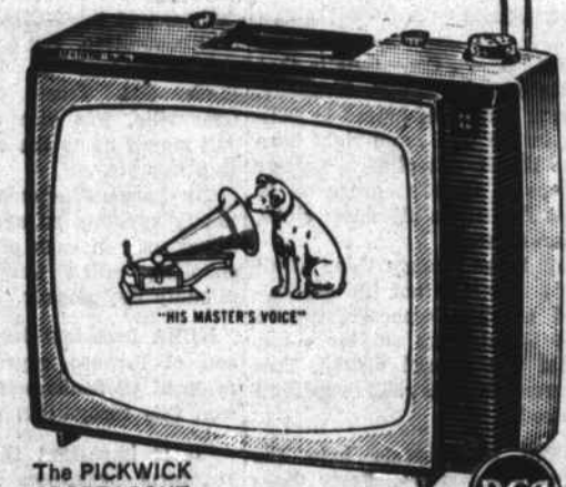
The PICKWICK SPORTABOUT Series 193-K-04-M 19" tube (overall diag.)—172 sq. in. picture