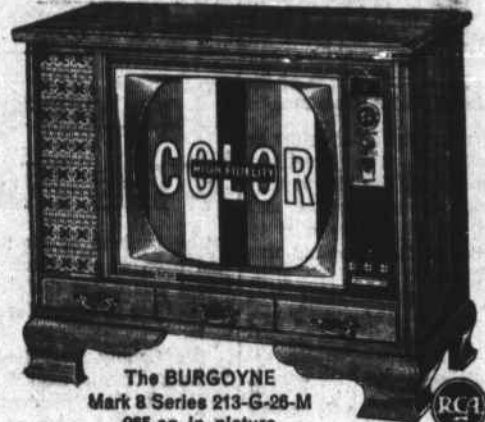
The BURGOYNE Mark 8 Series 213-G-28-M 28 1/2 sq. in. picture RCA VICTOR MARK 8 COLOR TV