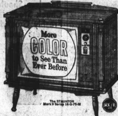
RCA VICTOR New Vista COLOR TV