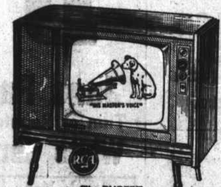
The RUPERT Series 236-C-60-M 23" tube (overall diag.) 282 sq. in. picture RCA VICTOR New Vista TV