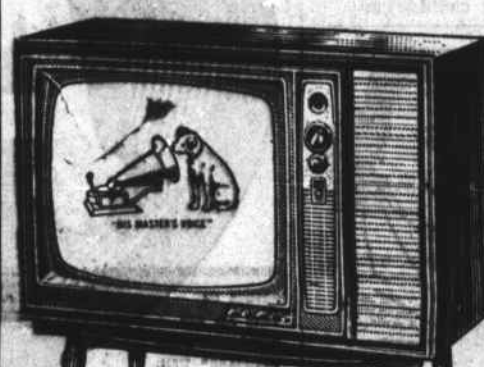
The BRANDON Series 233-C-89-M 23" tube (overall diag.) 282 sq. in. picture