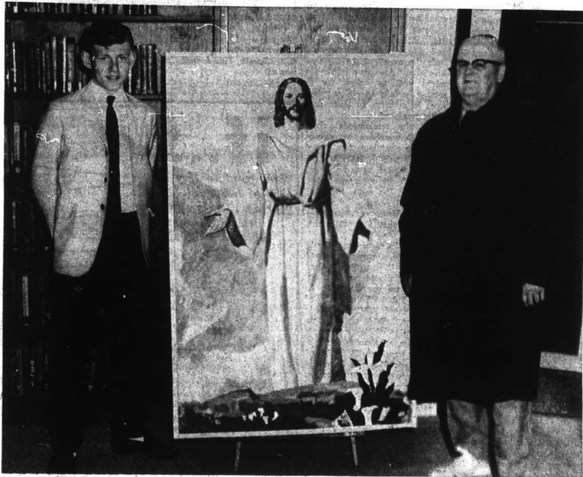
W. H. S. Student Wins National Award