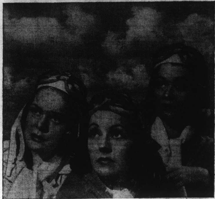
Alice Faye and Constance Bennett are consoling Nancy Kelly in this scene from "Tail Spin," thrill-drama of three women of the sky, at Taylor Theatre, Edenton, Monday and Tuesday. The film is being hailed as the greatest aviation picture in a decade.