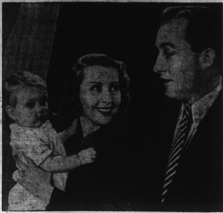
"Sandy," Joan Blondell and Bing Crosby in "East Side of Heaven" at Taylor Theatre, Edenton, today (Thursday) and Friday.