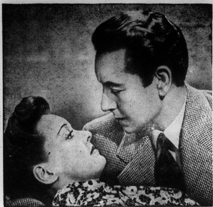
Bette Davis and Paul Henreid in "Now, Voyager," at Taylor Theatre, Edenton, today (Thursday) and Friday.