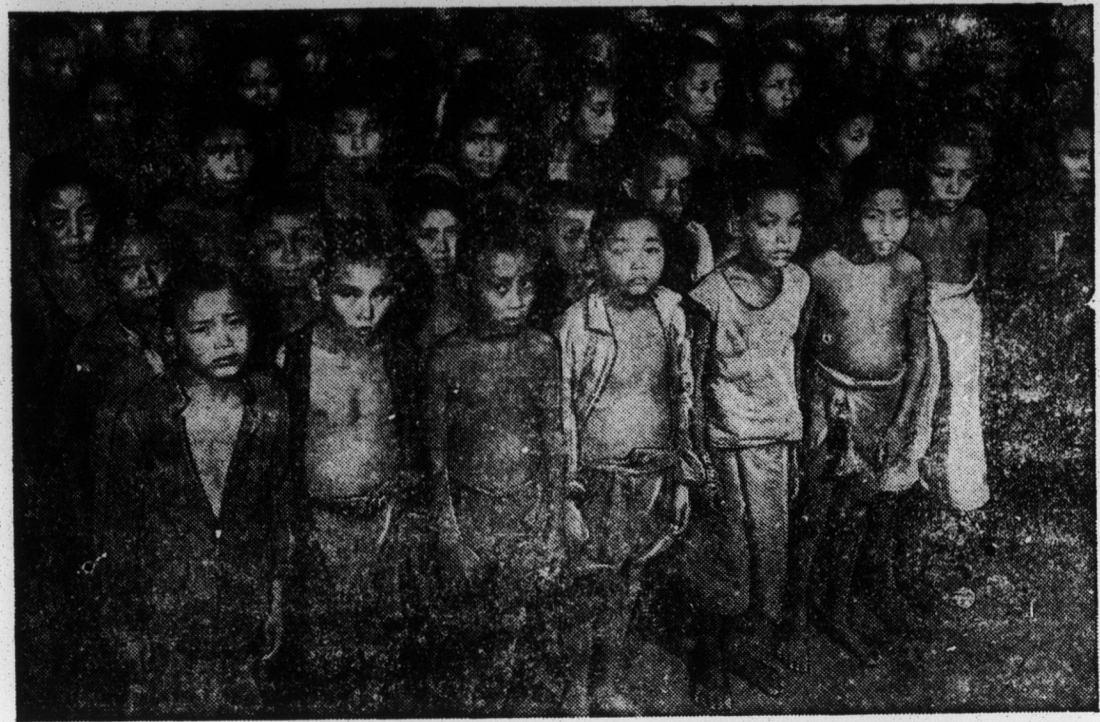
THESE Chinese war orphans must face the winter in threadbare rags. You can help them and millions of others who experienced the terror of war. Give all the clothing, shoes and bedding you can spare to the Victory Clothing Collection for relief of war victims. Let your old clothes take on new life overseas.