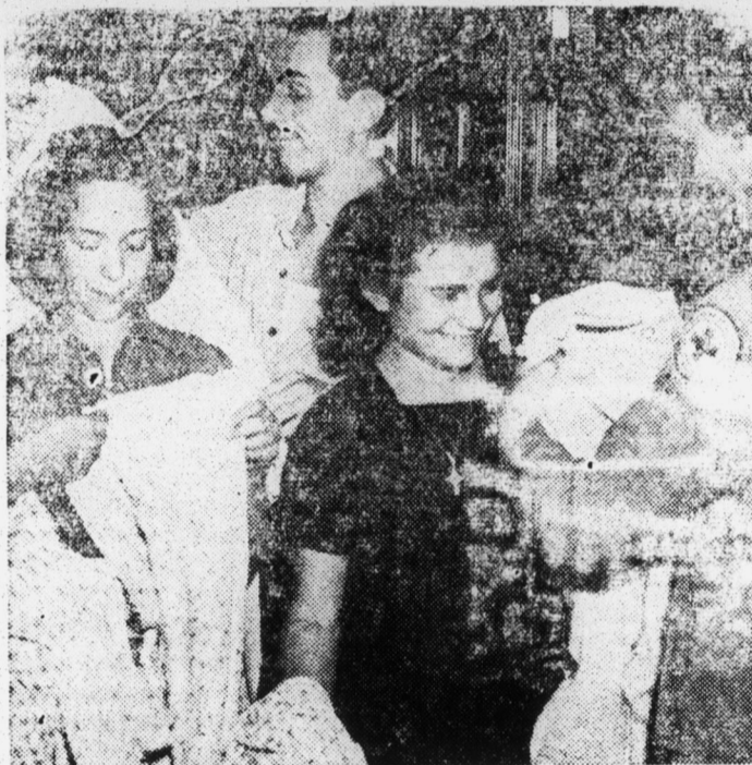
WAR VICTIMS—Millions of garments, large quantities of food and many medical supplies are provided by the Red Cross for destitute civilians ravaged by war.