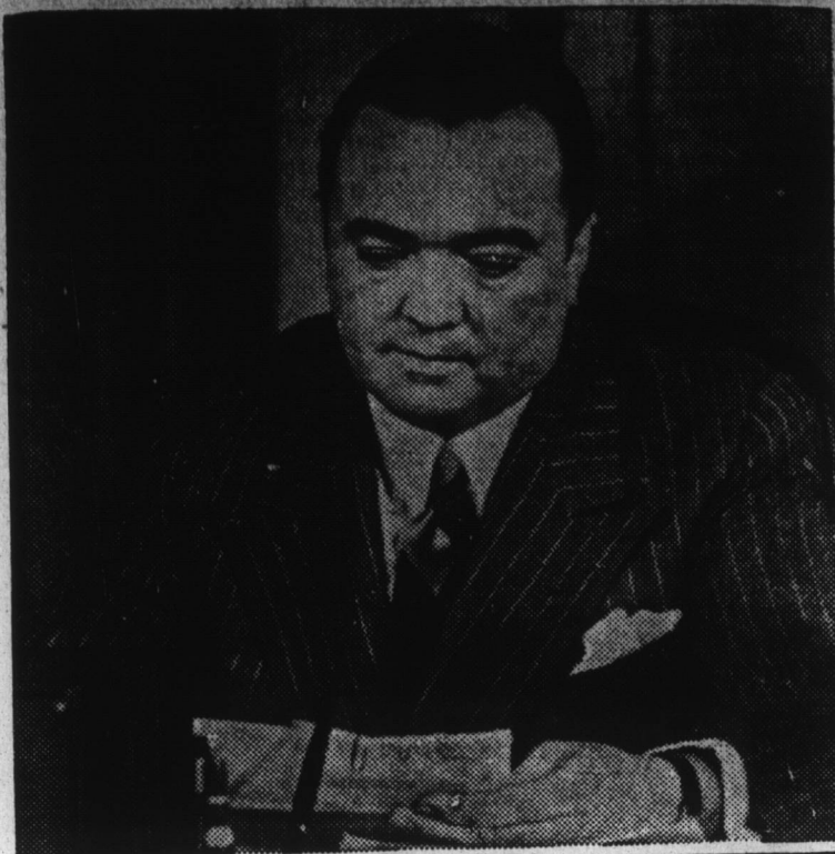
J. Edgar Hoover, head of the Federal Bureau of Investigation, and the country's No. 1 crime fighter, calls on the Christian Church to help banish juvenile delinquency. Mr. Hoover's article was prepared at the request of "The Rural Churchman," a paper published by the Episcopal Church in Colorado.