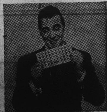
Every entry gets a certificate for the Family Sweepstakes

Right! Some lucky family is going to collar a cool $25,000 Cash! That's the grand pay-off among 40 Family Sweepstakes Prizes in Pepsi-Cola's terrific "Treasure Top" Sweepstakes and Contests. It could be your family—every entry* you send in wins you points for the Family Sweepstakes Prizes. So enter often—get your whole family started! 51 Cash Prizes each month in your state—plus big Monthly National Prizes! Total Cash Prizes $208,725.00!