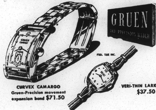
CURVEX CAMARGO Gruen-Precision movement expansion band $71.50

We know of at least one prospective mother-in-law who made sure that the groom-to-be was on time to his own wedding! She gave him a handsome Gruen-Precision Watch. Whether for the bride or groom, a gift of a Gruen watch is the ideal way to say "good luck." Choose from Gruen Curvex or Veri-Thin styles. Priced from $33.75.