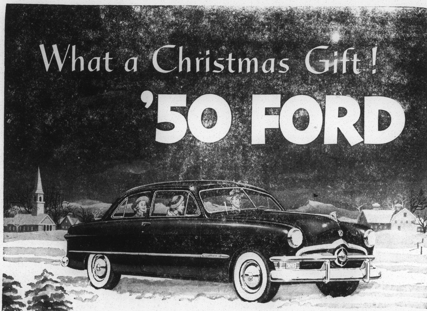
White sidewall tires available at extra cost.

For Prompt and Regular Service! Distributors of MILLER'S Fine Dairy Products