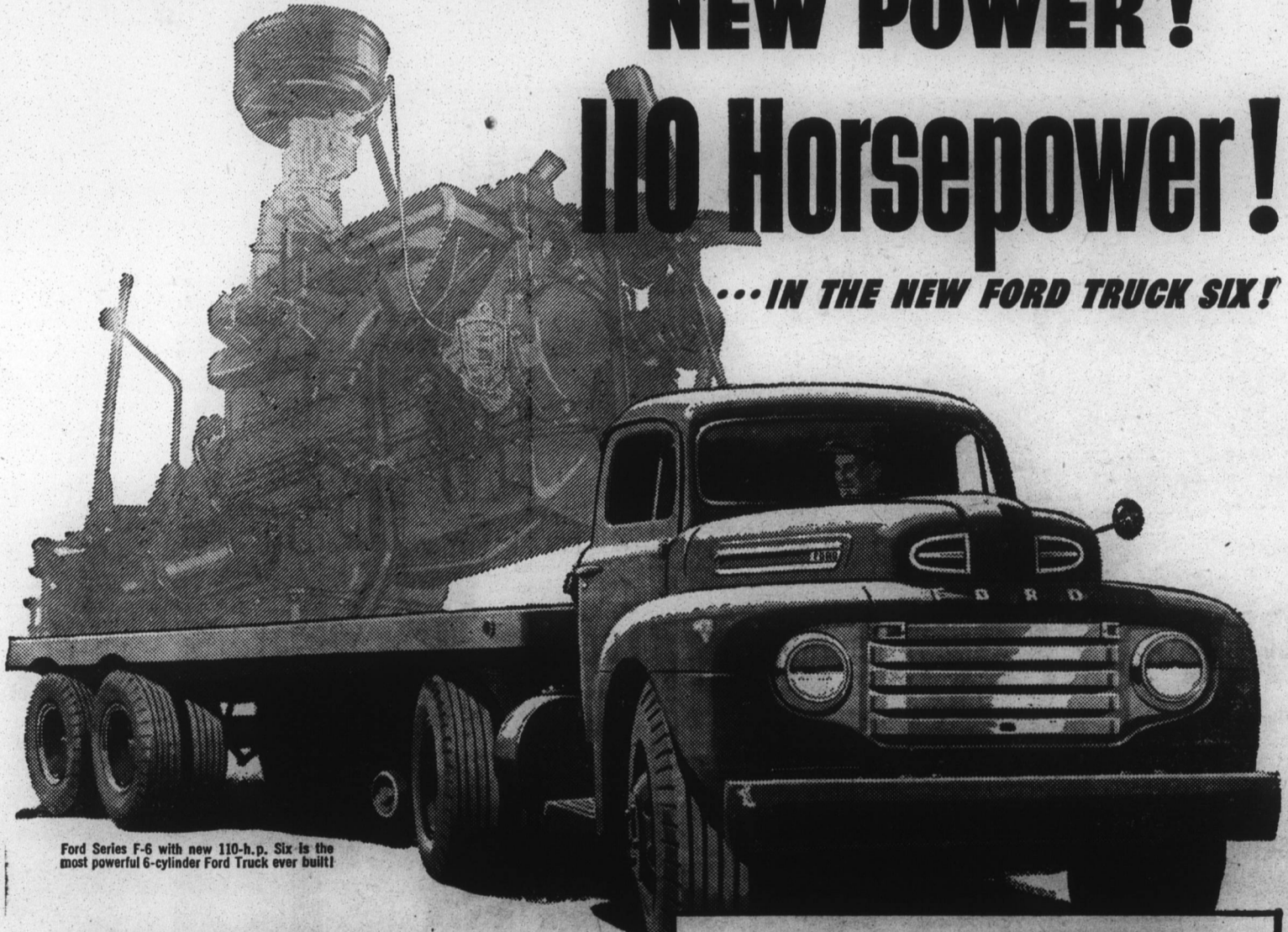
Ford Series F-6 with new 110-h.p. Six is the most powerful 6-cylinder Ford Truck ever built!

NOW... NEW ECONOMY! NEW PERFORMANCE! NEW POWER!