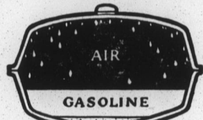
Water forms regularly by condensation in every car's gasoline tank—causes rust and corrosion throughout whole fuel system when you use ordinary gasoline.

Today ordinary gasoline has become old-fashioned. Today your Sinclair Dealer offers you POWER-PACKED Gasolines with an amazing EXTRA VALUE—a new chemical ingredient that solves the problem of rust and corrosion in your gasoline tank and fuel system. It's RD-119, a product of Sinclair Research.