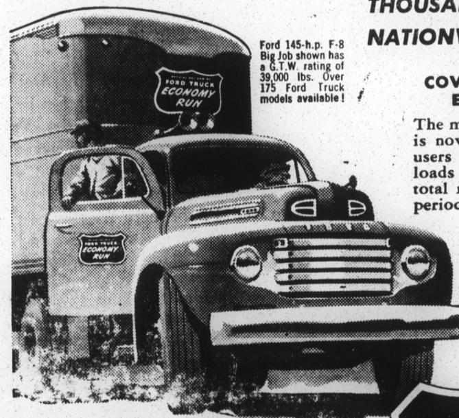
Ford 145-h.p. F-8 Big Job shown has a 6.1 W. rating of 39,000 lbs. Over 175 Ford Truck models available!

THOUSANDS of FORD TRUCKS START NATIONWIDE FORD ECONOMY RUN!