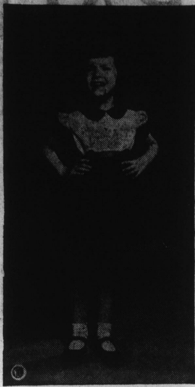
Youngest scholar of them all will be teacher's pet in this back-to-school frock from Youngland in Bates disciplined cotton. In contrasting colors, the bodice repeats the dark color of the skirt in the collar and sleeves. The belt through loops is a "big-sister" touch.

The truth hurts people who do not like to face facts.