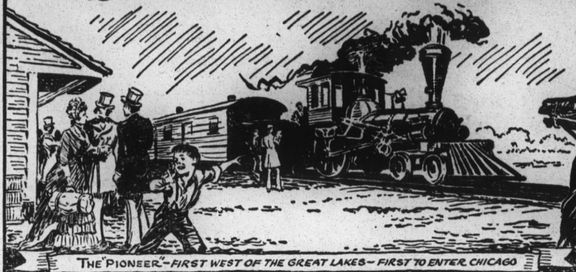
THE PIONEER—FIRST WEST OF THE GREAT LAKES—FIRST TO ENTER CHICAGO

A CENTURY OR SO AGO THE IRON HORSE ROLLED PROUDLY WEST ACROSS THE FLAT LANDS, BELCHING WHITE RAGS OF STEAM AND SHOWERING SPARKS—AN AWESOME SIGHT. STRADDLING RIVERS, TUNNELING MOUNTAINS, RUNNING OVER PRAIRIES, THE DURABLE AND POWERFUL STEAM ENGINE HELPED OPEN UP THE CONTINENT.