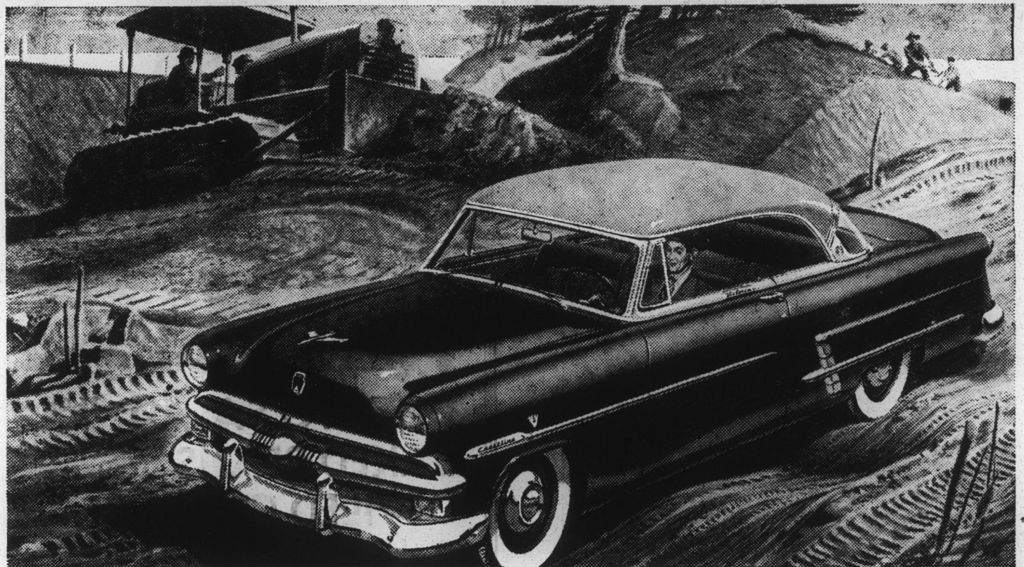
Formatic Drive, Overdrive, white sidewall tires, 1-Rated limited safety glass optional at extra cost. Equipment, accessories and trim subject to change without notice.

Elizabeth City — Edenton — Hertford — Manteo — Sunbury