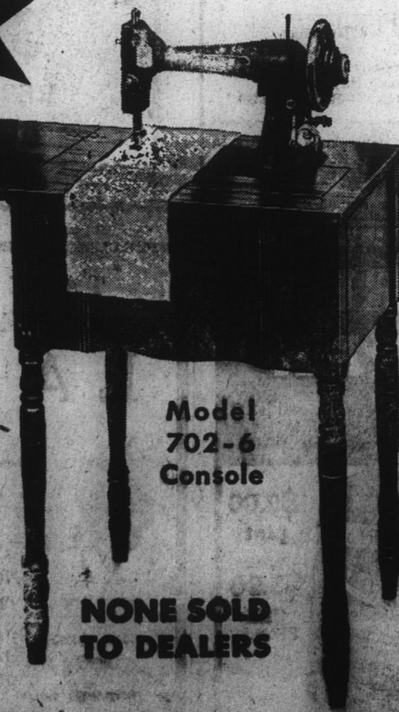
Model 702-6 Console

You must act fast! For the next two days only and by special arrangement with the manufacturer we are offering a new Domestic Sewing Machine at less than what you would expect to pay for a used or rebuilt model. This dependable machine features an attractive console cabinet, 2 thread lockstitch, air cooled motor and bobbin winder. Don't be disappointed. Come in while our limited stock lasts.