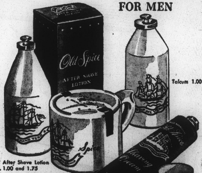
After Shave Lotion 1.00 and 1.75