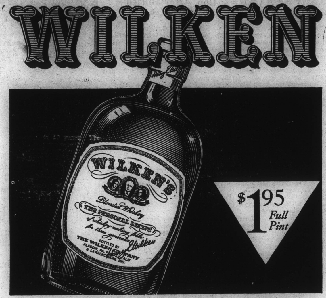
THE WILKEN CO., LAWRENCEBURG, IND. . BLENDED WHISKEY . 85 PROOF . 721/2 GRAIN NEUTRAL SPIRITS

Lula White's Flower Shop 203 WEST: CHURCH STREET