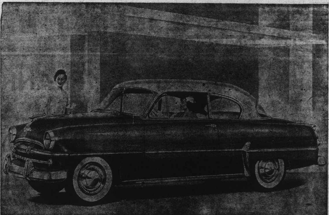
The six-passenger Belvedere sport coupe typifies the new styling of 1954 Plymouth cars. It is longer than the previous model and has a completely restyled interior. All 1954 Plymouths are available with power steering and with Hy-Drive, a no-shift combination.