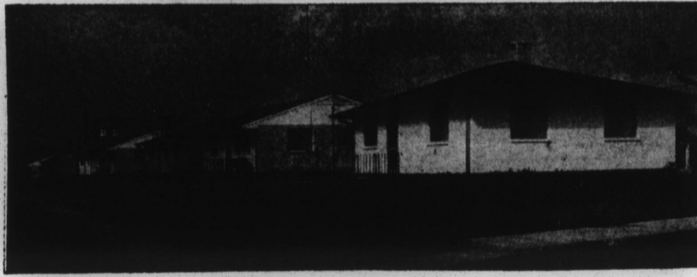
This view shows several of the attractive concrete block houses in the new 50-unit housing development built for employees of the State Hospital in Raleigh. The State considers this one of the best housing investments it has ever made.