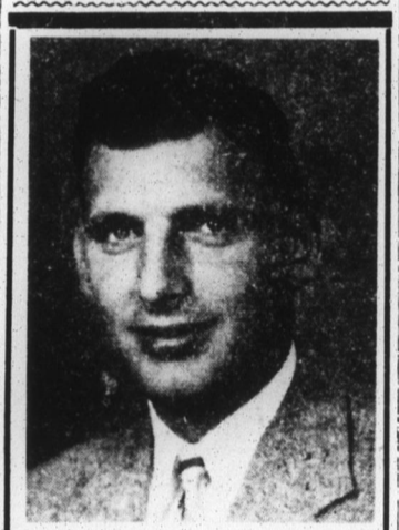
JOE THORUD SAYS:

BLENDED WHISKEY • 37½% STRAIGHT WHISKEY 6 YEARS OR MORE OLD • 62½% GRAIN NEUTRAL SPIRITS • GOODERHAM & WORTS LIMITED, PEORIA, ILLINOIS