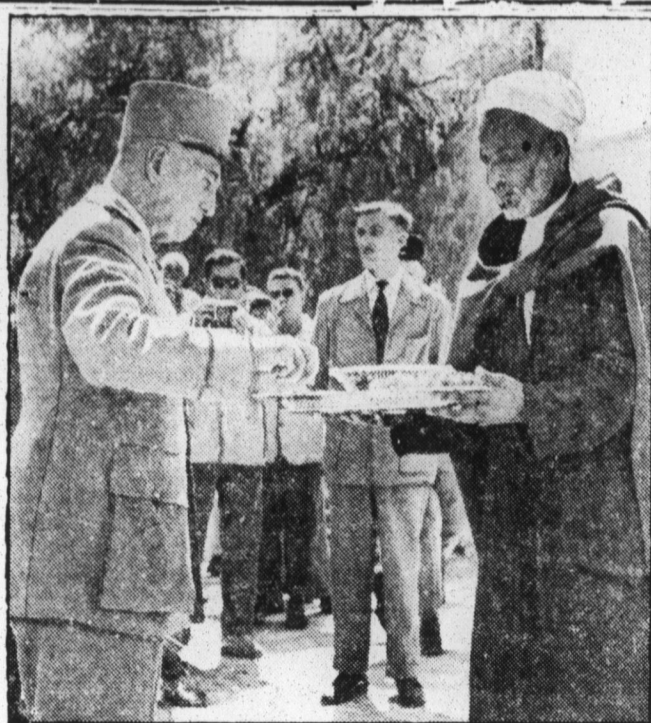
"DATE" WITH DESTINY—Gen. Pierre Boyer de Latour, newly appointed resident general of French Morocco, accepts the traditional Arabian offering of dates and milk as a sign of hospitality as he visits Oued Zem, scene of a recent bloody uprising of Berber tribesmen. He replaces Gilbert Grandval as France attempts to cool seething unrest in North Africa.